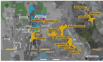
Figure 2 – Fosterville South Overview Map